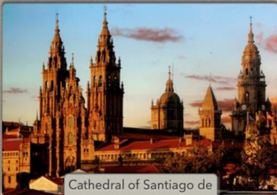
Cathedral of Santiago de Compostela (Spain)