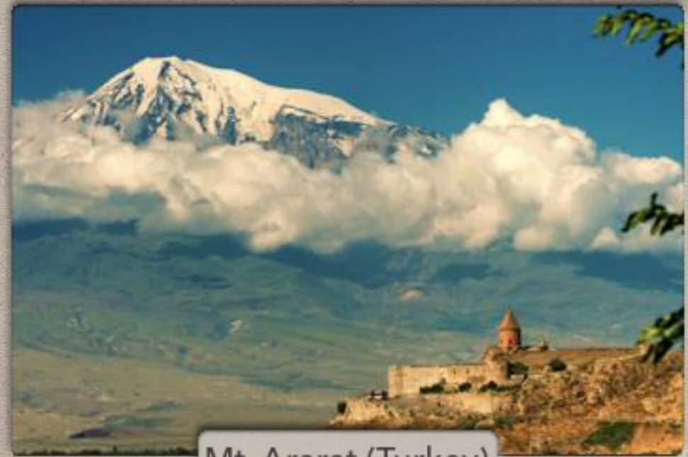
Mt. Ararat (Turkey)