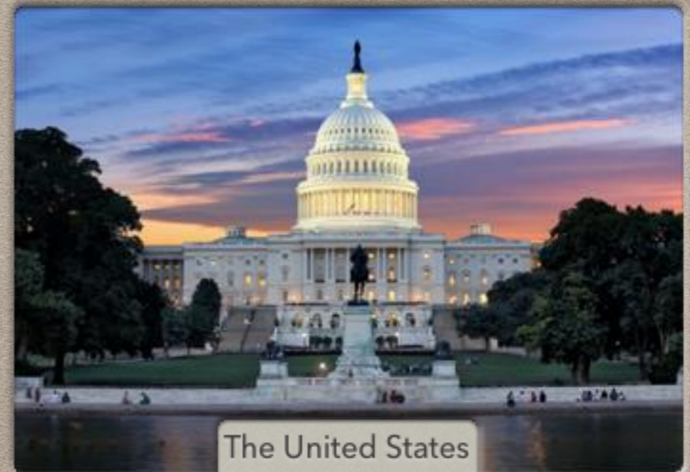
The United States of America